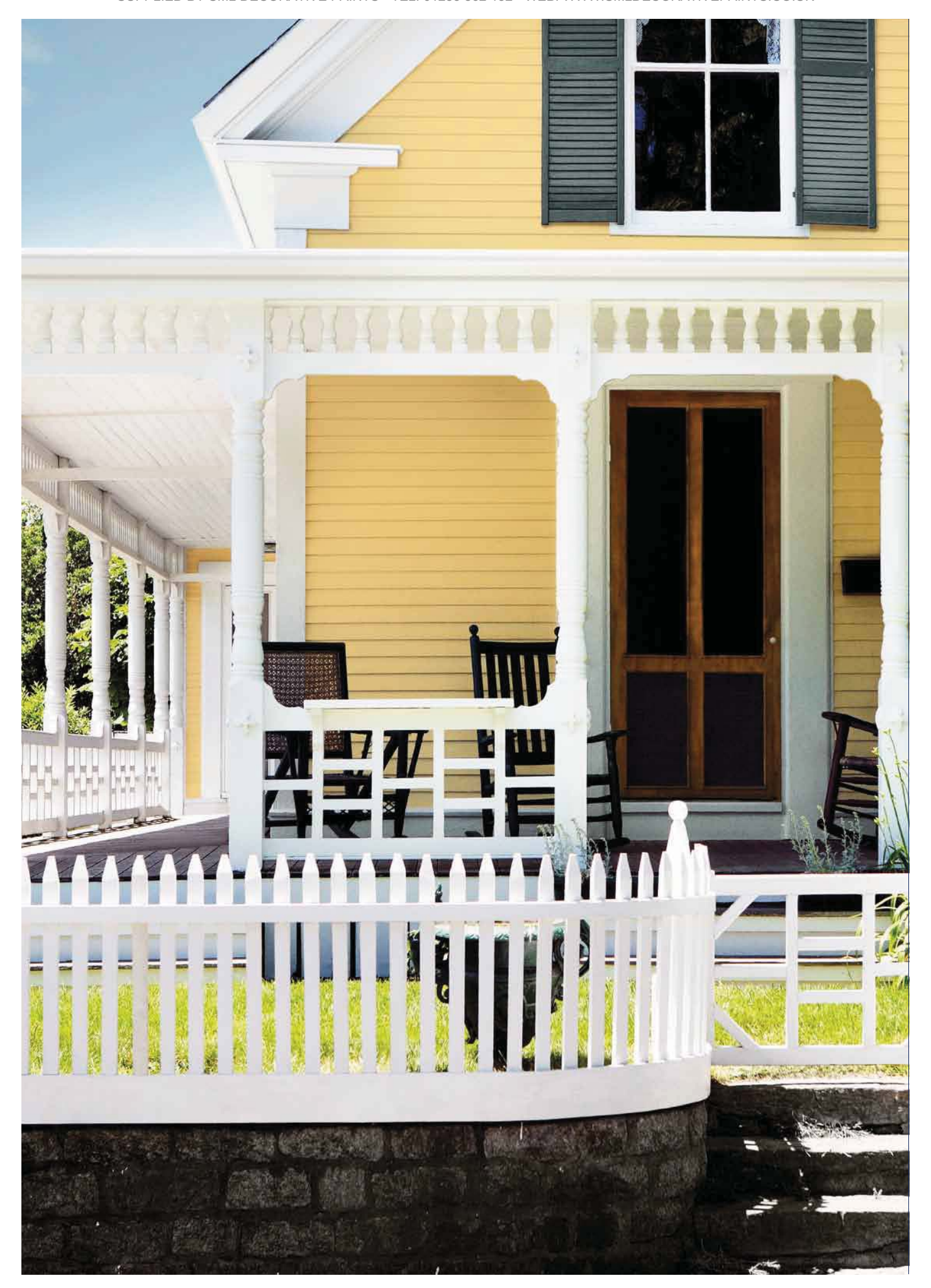
FOR FREE ADVICE AND TRADE PRICES - CONTACT SML DECORATIVE PAINTS