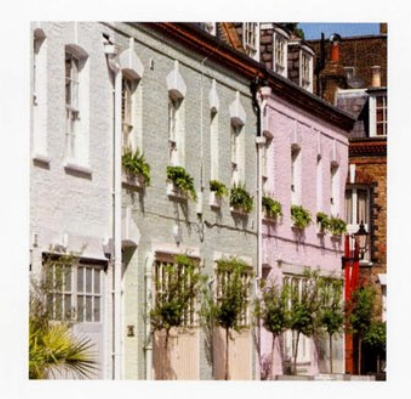
2509 Light Quartz 1104-Y64R