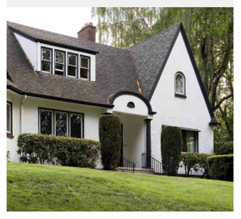
Jotun Mur 7