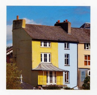
1909 Chalk Ochre 3026-Y19R