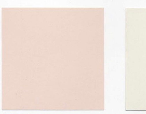
1638 Horizon 1101-Y11R