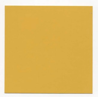
1905 Golden Ochre 1834-Y16R