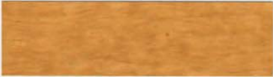
645 Sand Stone