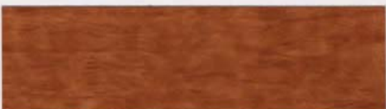
623 Burma Teak