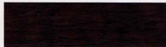
9133 Dark Brown