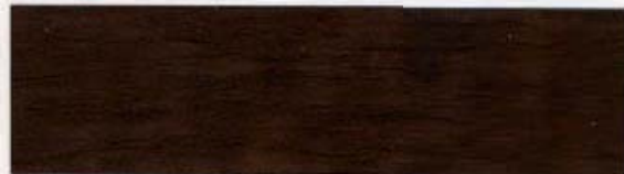
676 Tar Brown