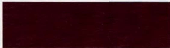
9203 Warm Ember