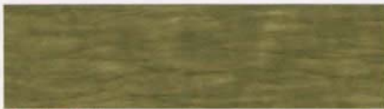
839 Silver Birch