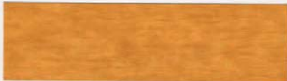
630 Pale Oak