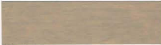
848 Antique Grey