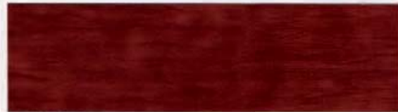
9132 New Cherry