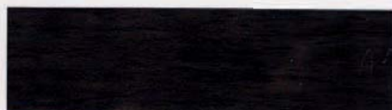
683 Soot Grey

This colour card should be used as a guide only. Please note that the colour of the wood substrate will affect the final colour. We recommend that you apply the stain to a hidden test area before starting work.