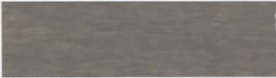
9076 Sand Grey