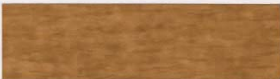
853 Green Ochre