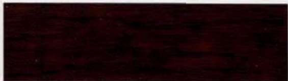
9134 Deep Mahogany